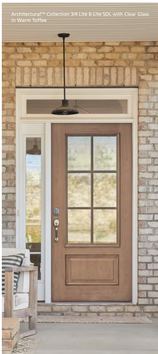
Architectural™ Collection ¾ Lite 6-Lite SDL with Clear Glass in Warm Toffee

Fiberglass doors combine functionality with aesthetic appeal, giving homeowners a wide range of options for their entryways. There are several types of fiberglass doors, each with unique qualities to suit your preferences and home style.