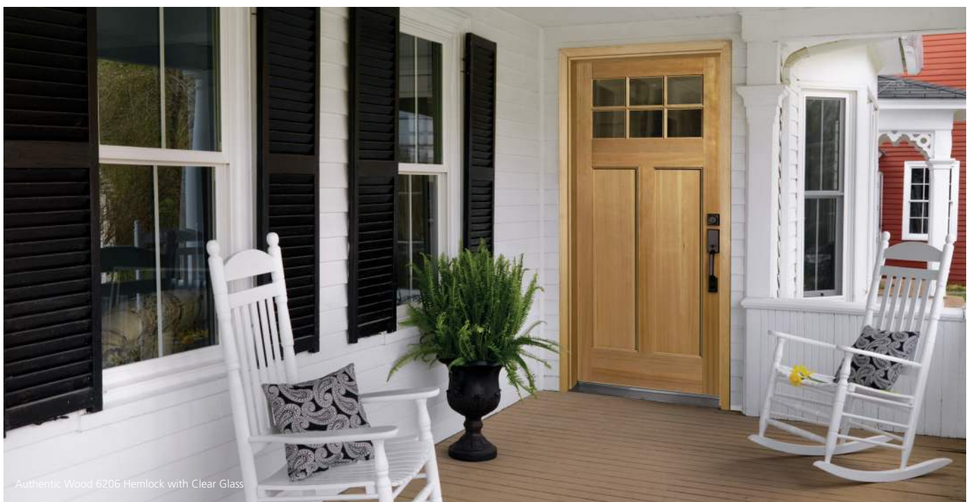
Authentic Wood 6206 Hemlock with Clear Glass