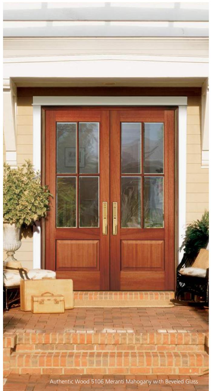
Authentic Wood 5106 Meranti Mahogany with Beveled Glass

Here at JELD-WEN, we handcraft our doors from the finest materials, offering a wide array of beautiful design options, from wood species to panels to glass types and decorative accents. In addition to offering designs to match every architectural style, our artisans excel in customization.