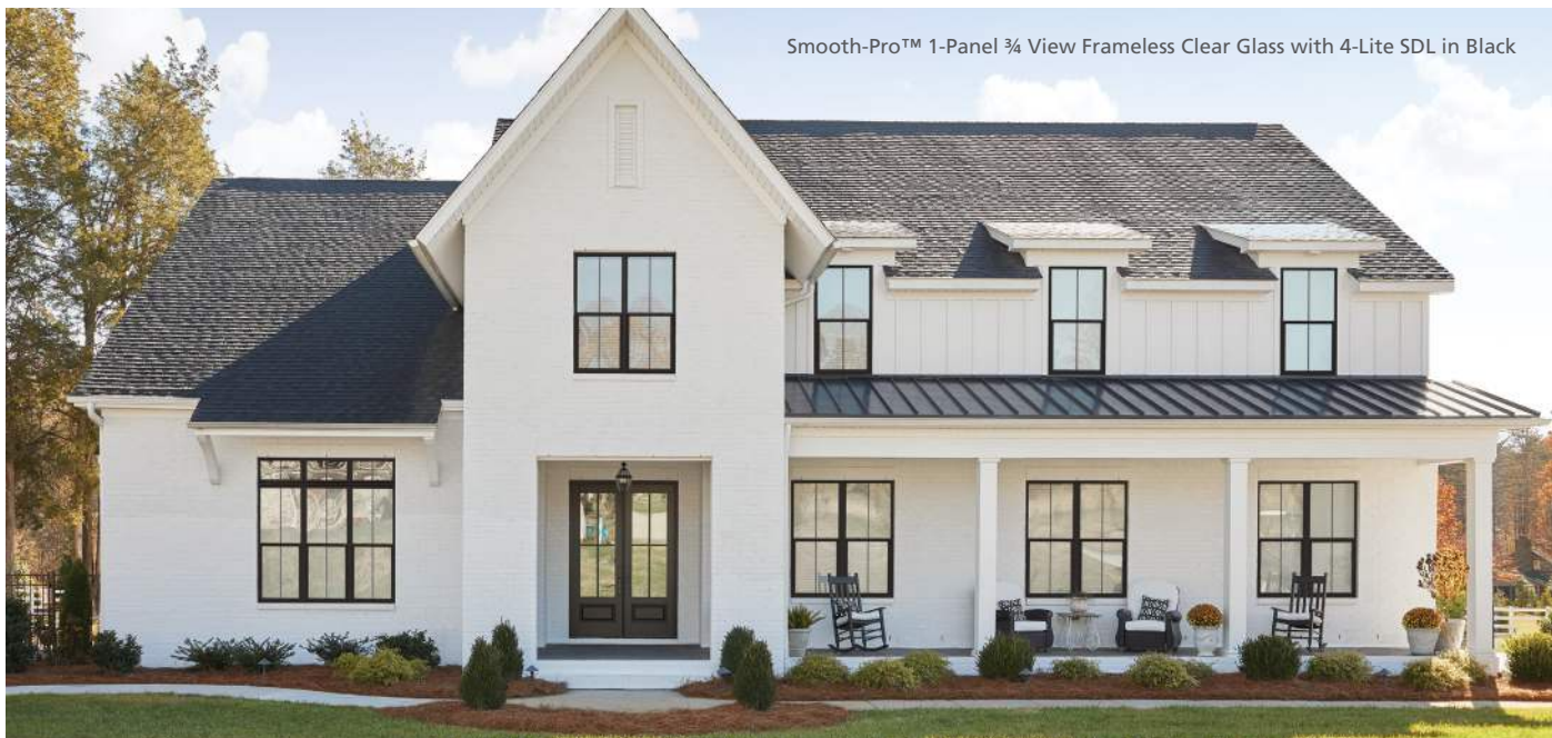
Smooth-Pro™ 1-Panel ¾ View Frameless Clear Glass with 4-Lite SDL in Black