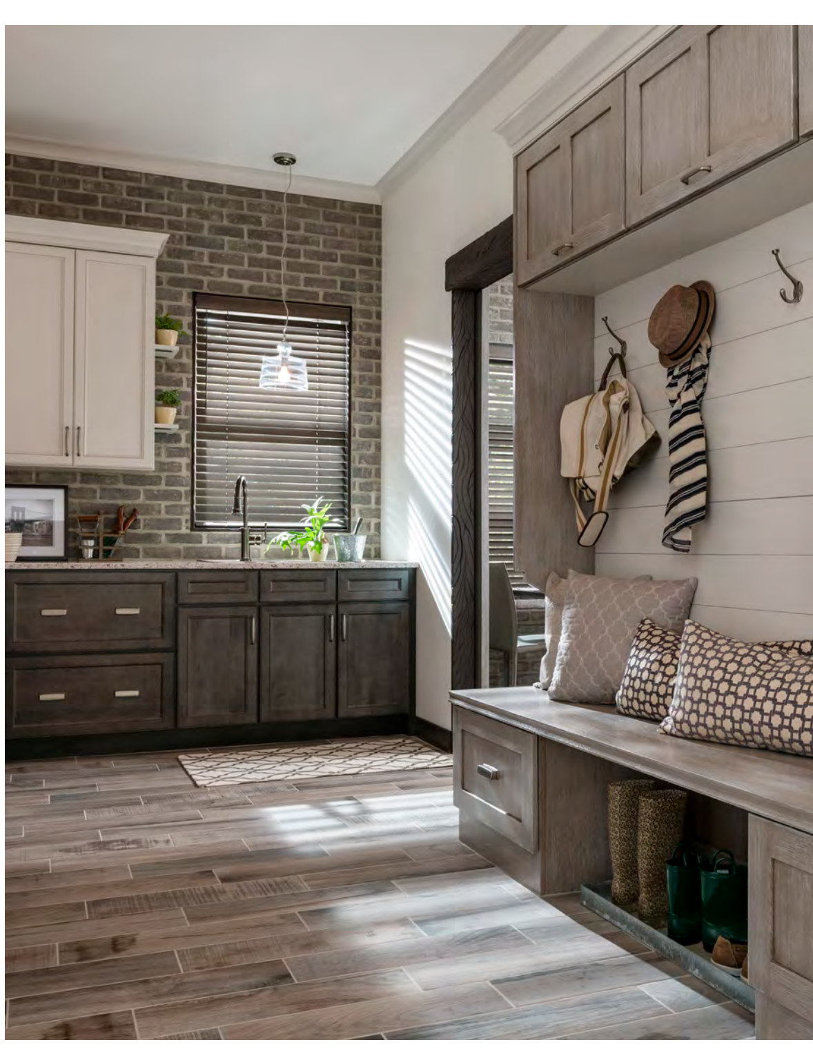
GET THIS LOOK | GREYSTONE MANOR Get details on door styling on page 21.