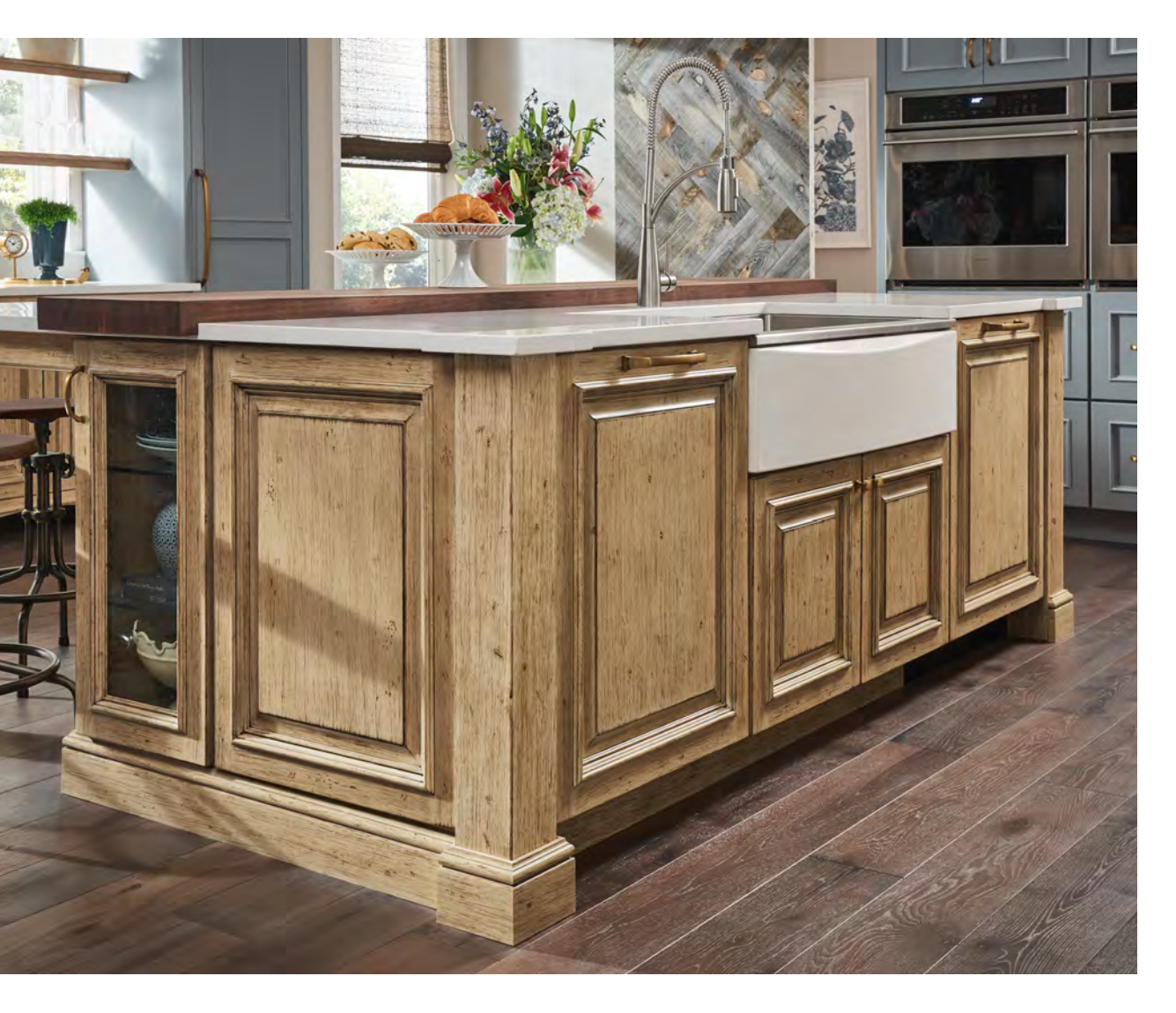
GET THIS LOOK | MODERN ENGLISH COTTAGE See door styling details on page 21.

Chat while you construct a cheese board and clear away food scraps without stepping away with a spacious center island that combines seating, prep space, cleanup solutions, and storage.