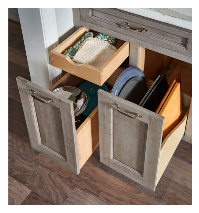
BAKE | Create a cabinet based on the way you cook. Organize all your baking trays, mixing bowls, and hot pads in one place with a custom piece.

More utensil organization ideas on page 19.