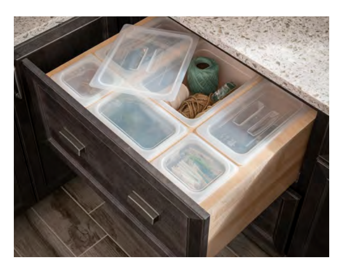
See more ways to use these storage bins and deep drawer dividers on page 16.