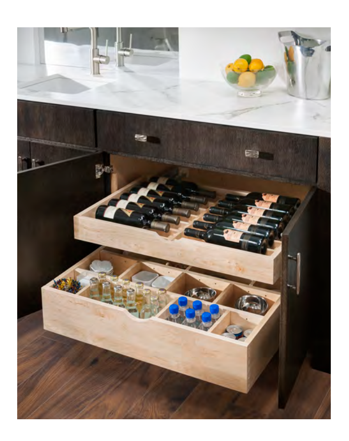
ENTERTAIN | Specialized wine racks and adjustable drawer organizers for snacks, dishes, and drink mixers roll easily out in heavy-duty drawers.