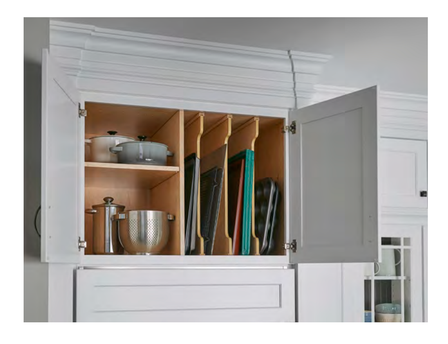
BAKE Keep pans and cookie sheets clearly divided and easy-to-access for last-minute brownie bakes. Measuring cups and more live right underneath, and a drawer liner minimizes rattling and clattering.

Test out new flavors or give family baking lessons with cabinets set up to get you started quickly. Shelves hold all the essentials, doors tuck in neatly, and the whole cabinet sits right at the counter height for a simple transition from preparation to putting it all away.