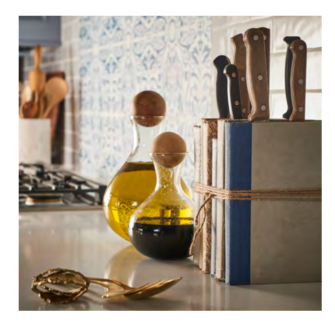
PREP/COOK A tiered spice drawer between the range and ovens makes it easy to find the paprika, and a divider tray makes space for other key utensils.

This cooking corner puts everything in reach whether you're baking or sautéing. Include a specialized drawer organizer, arranged with your frequently-used items in mind, and quickly select a dish, napkin, or pitcher from the open shelves.