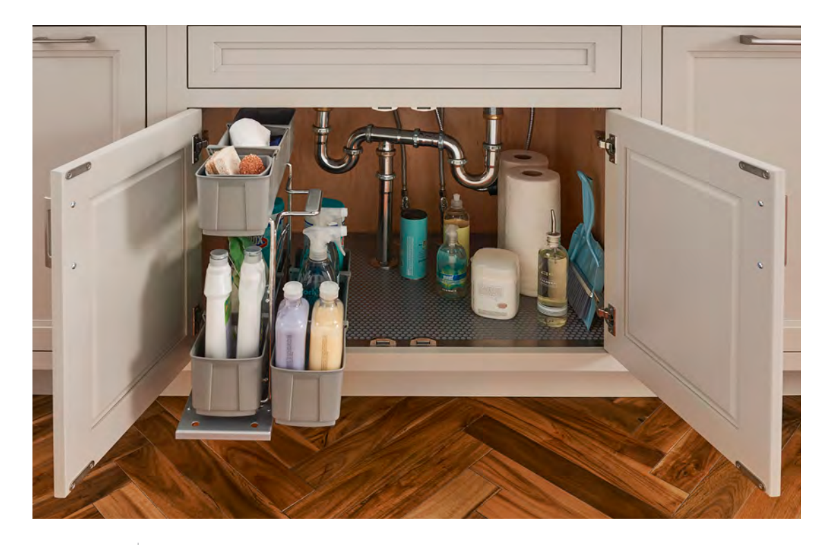
ORGANIZE A sink mat and pull-out storage for supplies you can bring with you—everything you need to clean up contained in one cabinet!

ENTERTAIN simplify your party plans | pages 10, 19