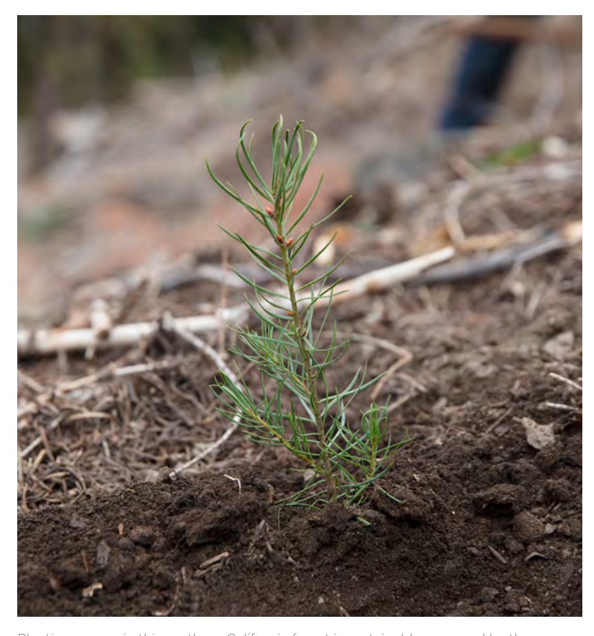
Planting season in this northern California forest is sustainably managed by the Michigan-California Timber Company, our primary timber supplier.