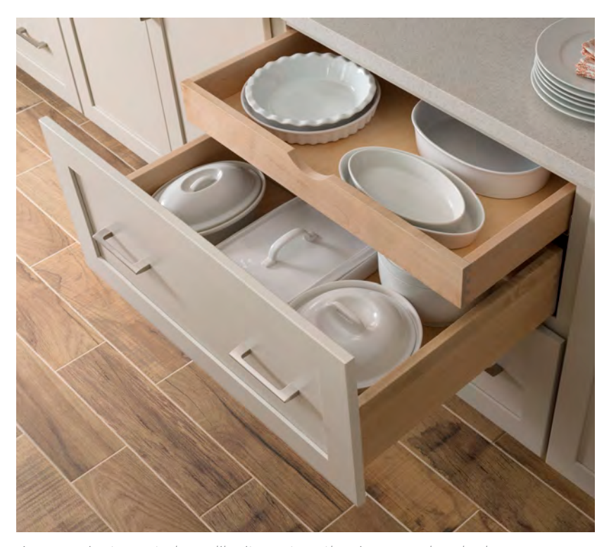
A convenient way to keep like items together in a seamless look—see more storage ideas for tiered hidden drawers on pages 10, 14, 17 and 21.