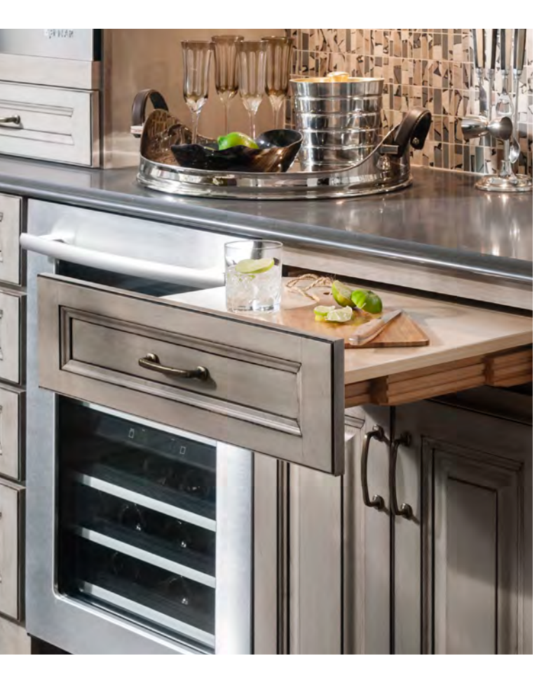
GET THIS LOOK | REFINED COASTAL Get details on door styling on page 21.

Mix aperitifs at an easy-access beverage bar, located right where your guests are. A pull-out work surface creates extra counter space to slice limes, dice mint, or prepare your other signature cocktail garnishes. Utensils and snack dishes are conveniently organized just steps away in the main cooking space.