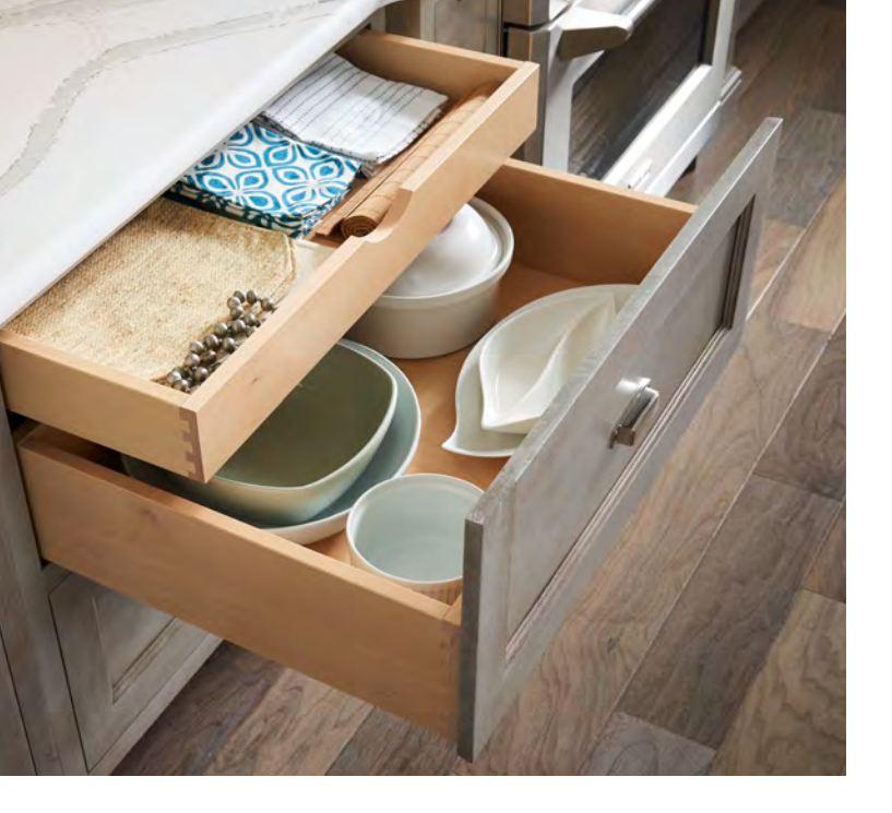
PREP | Conceal both mixing dishes and cleaning cloths in two drawers that look like one.