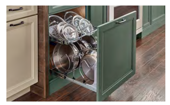
ORGANIZE | High cabinets are easily accessible with a pull-down shelf or one that swings out from above the refrigerator. And a unique cookware organizer pull-out makes it easy to select the size you need without setting off an avalanche of lids.