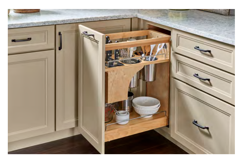
DECLUTTER | Choose the best place to store your knives: a dedicated drawer or a specialized pull-out like this one.