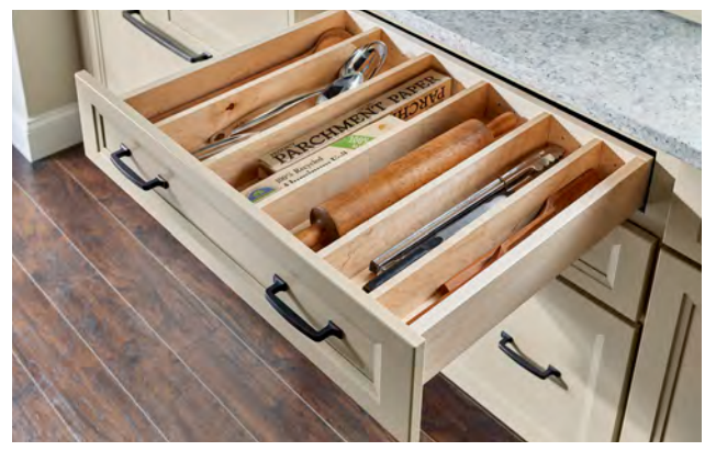
DECLUTTER | Keep electronics off counters with a dedicated charging station and keep long kitchen items tidy with an adjustable shallow drawer divider.