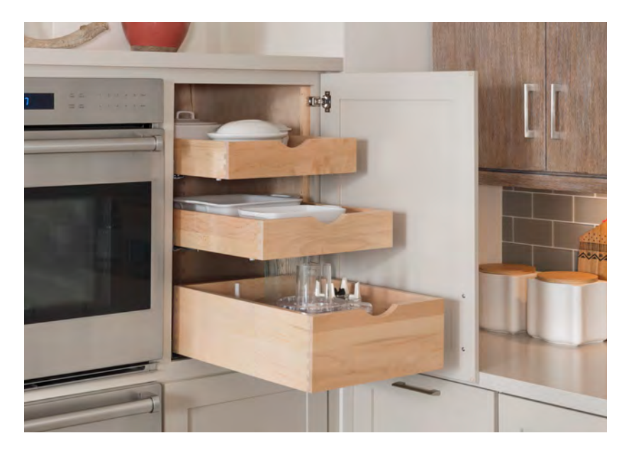
BAKE Neatly arrange pie pans and crockery next to the oven at a convenient height, and store your trusty stand mixer where it effortlessly rises to the next culinary challenge.