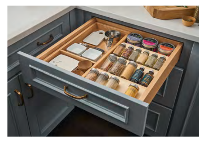
See more ways to organize spices on pages 6 and 14.