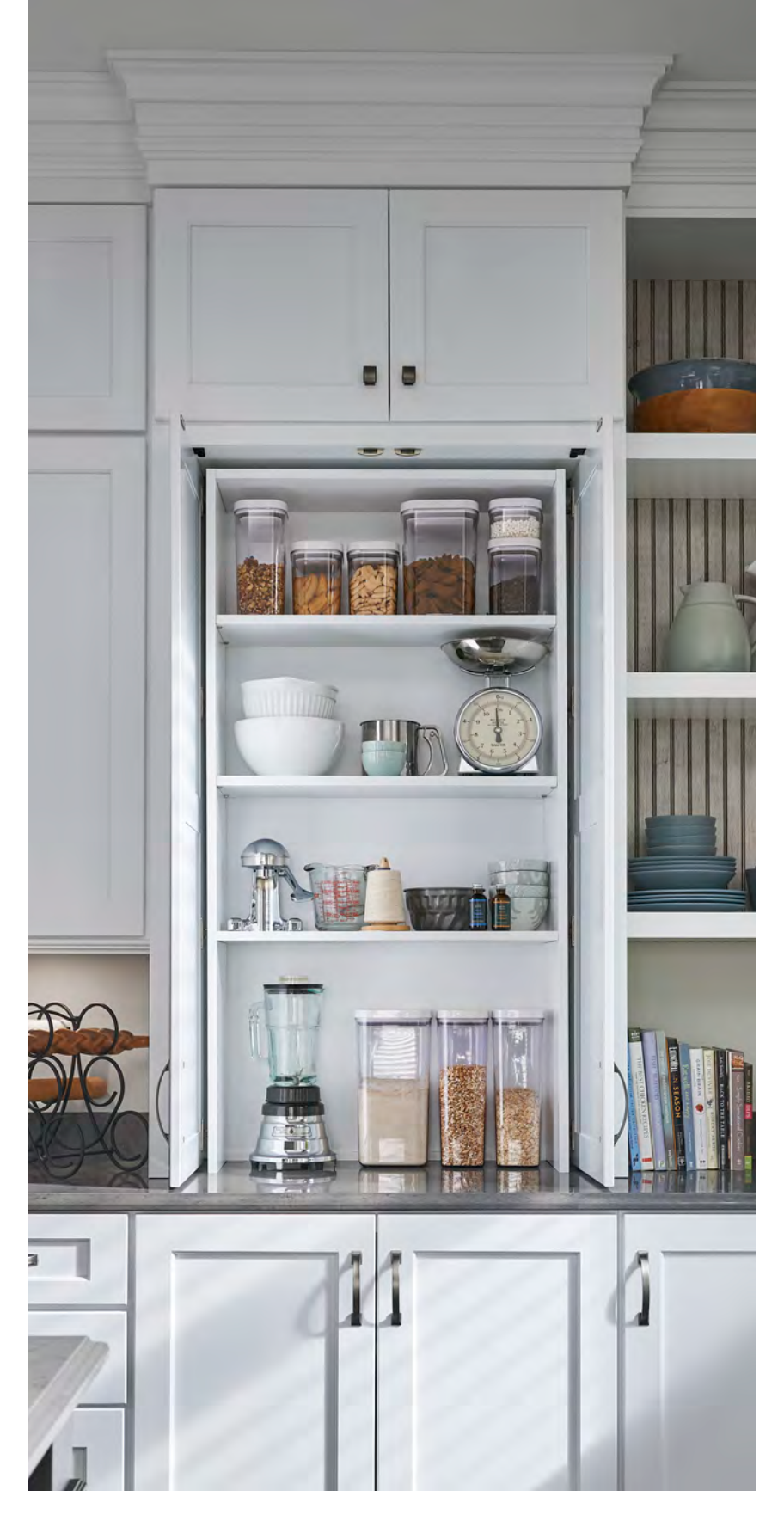
GET THIS LOOK | VINTAGE CHIC Get details on door styling on page 21.