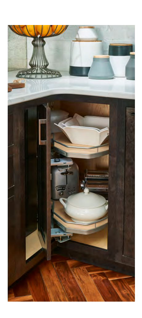
SERVE | Built just for Platinum, this lazy susan corner cabinet has a door that travels with the shelves inside. It spins right back to close and blends in with your other inset cabinetry.