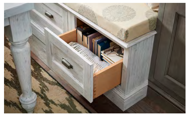
ORGANIZE Tuck spare books or linens away underneath the bench seating.

For a busy household, a multipurpose space just steps from the kitchen is the perfect way to enjoy life together. Play games, read, showcase décor, catch up with homework, or eat a quick bite—no matter what scheduling differences your family has, this space fits everyone's needs.