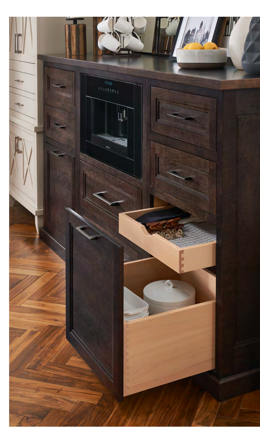
A convenient way to keep like items together in a seamless look—see more storage ideas for tiered hidden drawers on pages 13, 14, 17 and 21.