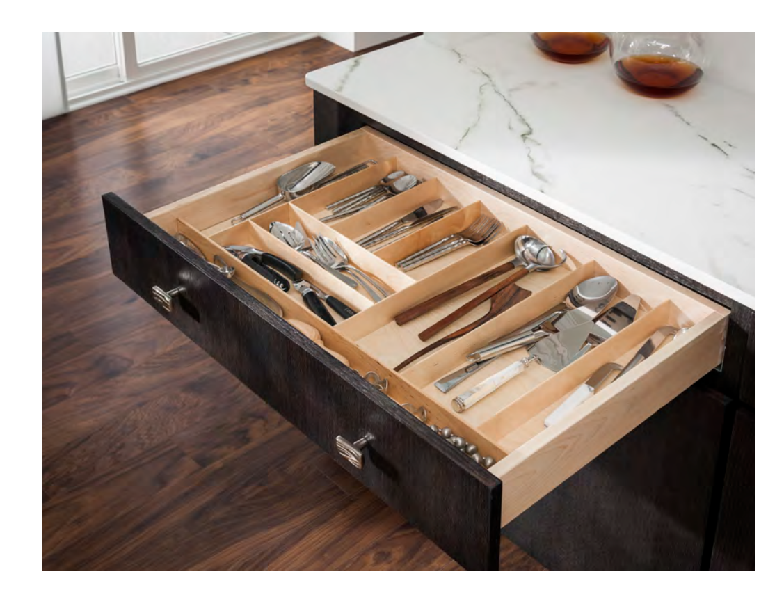
SERVE | Store corkscrews and bar tools right in the middle of the action so you don't miss a thing while fetching another bottle opener. See more utensil organization on page 14.

Pour a round of cabernet at a bar that makes even casual gatherings feel like Parisian wine-tasting soirées. Ample countertop space makes room for cheese boards and hors d'oeuvres and open shelves display your favorite stemware. Above, mirrored doors add a hint of luxe while concealing kitchen essentials, and beneath, smartly-organized cabinets contain all the ingredients for a memorable gathering.